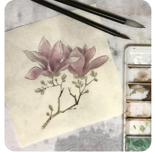
Painting on rice paper